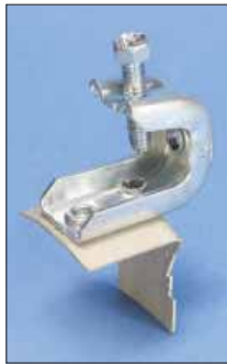
CATHPBC200B Screw-on Beam Assembly

for 1/2" – 3/4" flange with 360° rotation