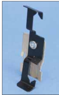
CATHP6Z34 Rod/Flange Assembly

for 1/8" – 1/2" flange with 360° rotation