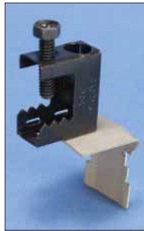
CATHPBCB Screw-on Beam Assembly

for 1/8" – 5/8" flange with 360° rotation