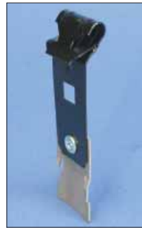
CATHPAF14 Z Purlin Assembly

for 3/8" threaded rod & 3/8" – 9/16" flange