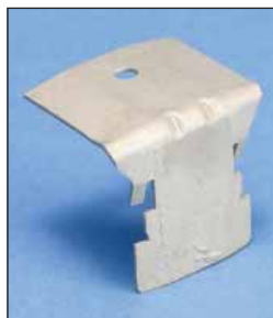
CATHPAN Angle Bracket