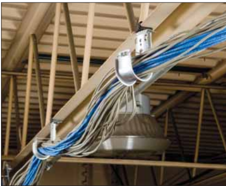
Hammer-on assembly, 360° rotation