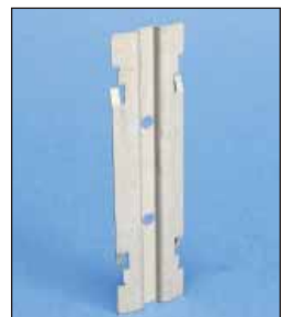
CATHPTM Tree Mounting Bracket