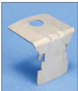
CATHPA6 Angle Bracket