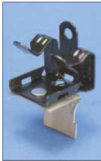
CATHP912 Hammer-on Assembly

CADDY CAT LINKS is designed to accommodate high-performance cabling upgrades, which will help eliminate the need to replace your infrastructure if additional cable or pathways are added.