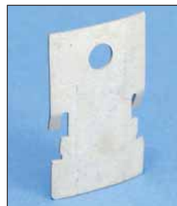
CATHPS4 Straight Bracket