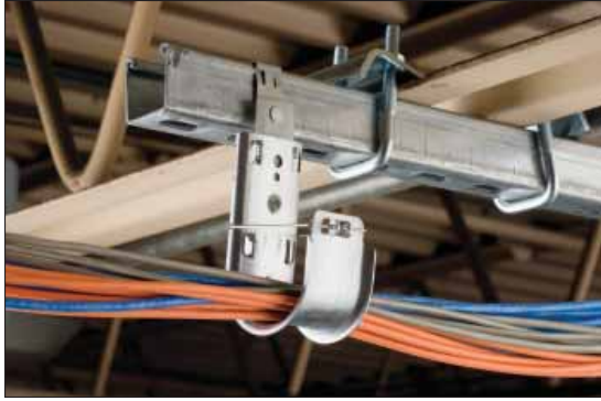
Strut assembly using CATHPESC