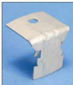
CATHPA4 Angle Bracket