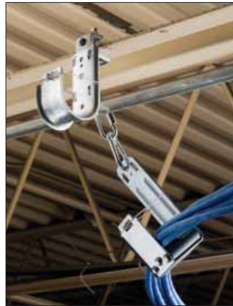
CATHPPLR cable puller assembly