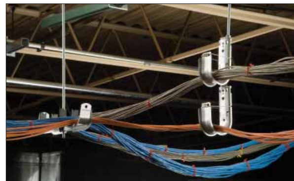
CADDY® CAT LINKS branching off from a CADDY® CAT CM