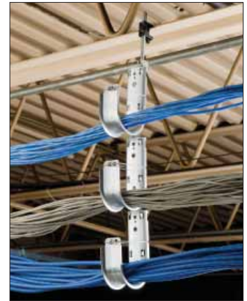
CAT48HP tree assembly