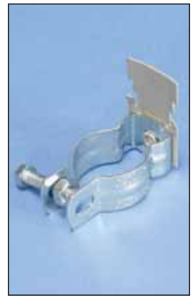
CATHPCD2B Underfloor Assembly