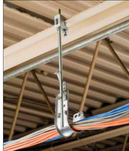
CATHP6Z34 for 3/8" threaded rod and 3/8" - 9/16" flange